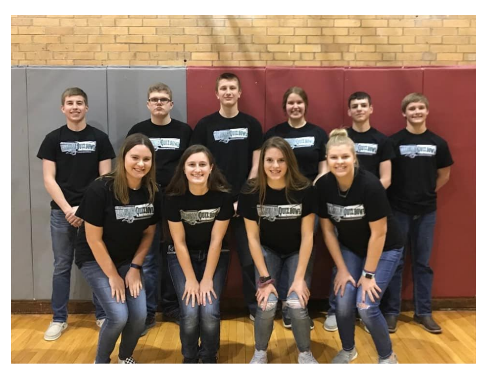
Jaguars are 2020 District Quiz Bowl Champions.